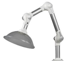
A-28-2 2" Diameter Articulating Arm

CONTACT: MURPHY ENTERPRISES OF AL INC https://WWW.AIRPURIFIERSANDCLEANERS.COM TOLL FREE 800-701-2513 EMAIL: SUPPORT@AIRPURIFIERSANDCLEANERS.COM