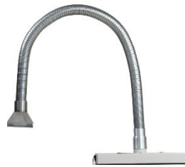
FXA-36-31 Stainless Steel Flexible Arm